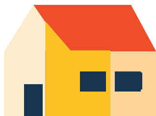
Conversion of Existing Floor Area